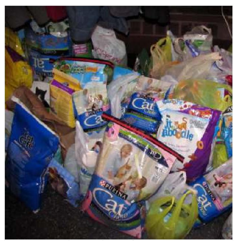
Just some of the cat food & litter donated at our Chinese Auction. The community does it again!

For more info, or to make a purchase, please contact Andrea at 315-823-4680 or Faye at 315-823-4680.