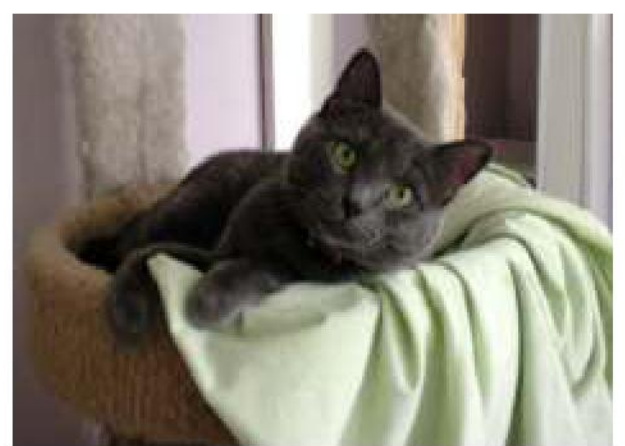
Hi! I'm Marlo, 3-4 years old and very sweet! Won't you please takeme home??

Liberty is a very sweet, very pretty, petite little tiger & white kitty! She is approx. 1 year old and was found by Lock 17 in Little Falls on 4th of July evening, lying in the tall grass and started meowing immediately when approached. It took a little work to catch her, but we think she's very glad we did. She is very friendly and loving and quite the chatterbox!