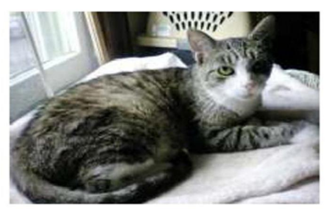
Liberty is a very sweet, very pretty, petite little tiger & white kitty! She is approx. 1 ½ year old and was found by Lock 17 in Little Falls on 4th of July evening, lying in the tall grass and started meowing immediately when approached. It took a little work to catch her, but we think she's very glad we did. She is very friendly and loving and quite the chatterbox!