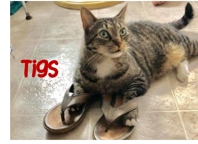
"Tigs" is a sweet girl who has been with us for 5 years - she's in with the kittens and watches them get adopted, hut she stave behind What about her?